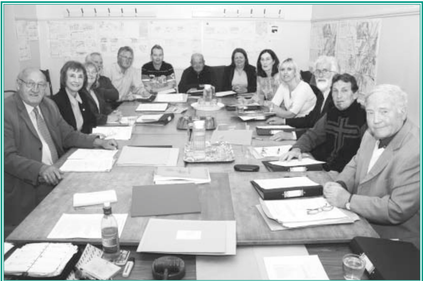
Councillors at the first meeting of the parish council

They also have a key role to play in monitoring, evaluating and commenting on the appropriateness of all planning applications in the parish, including supporting parishioners as appropriate. The chair of the parish council planning committee attends Doncaster Council's development control committee meetings and makes site visits as necessary.