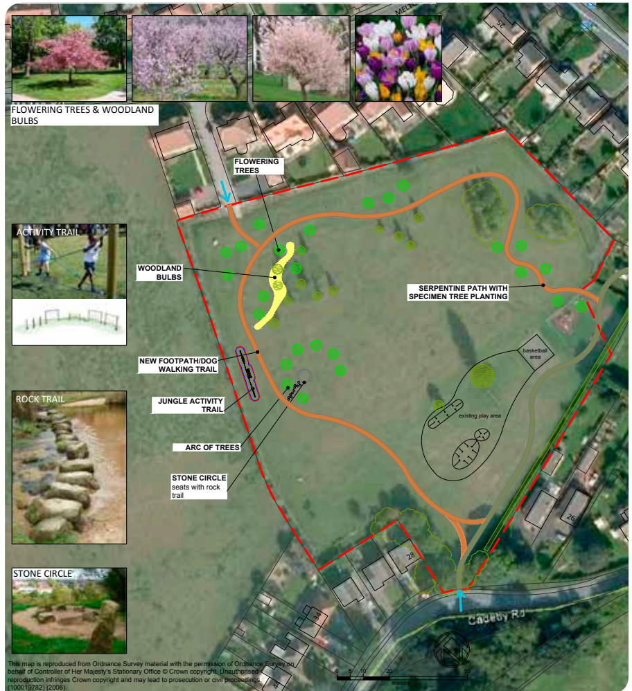
Artist impression of the proposals