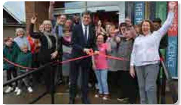
Cutting the Ribbon

"The library is run by volunteers and we are always looking for new helpers to join the ranks. If you can spare a bit of time to help us, please email the library at ScawthorpeCommunityLibrary@gmail.com or ring 01302 781786 . We would love to hear from you."