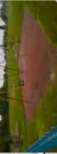
View of existing play area