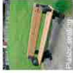
Plastic picnic table