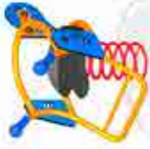
Springie prov. item