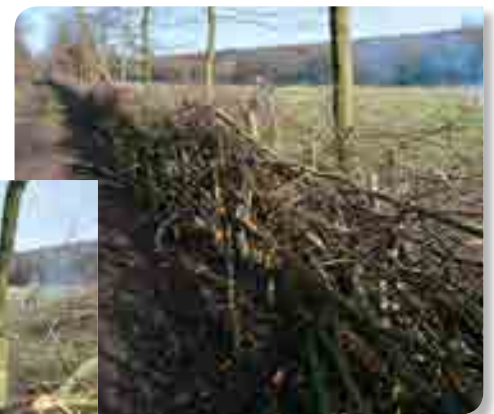
Pictured are some of the volunteers hedge-laying on the Trans-Pennine Trail