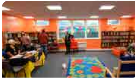
New window in children's area