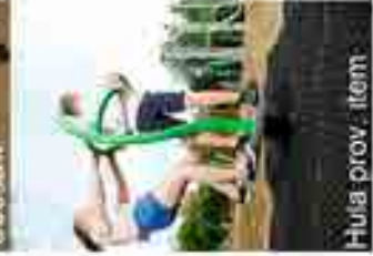
Hula prov. item