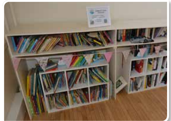
Book Loan Shelves