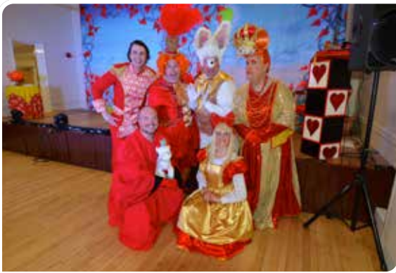
Dick Whittington Pantomime

Library, Sprotbrough Methodist Church, St Mary's Church and Brodsworth Parish Council has just come to an end after offering a warm welcome and refreshments to residents for the past few months.