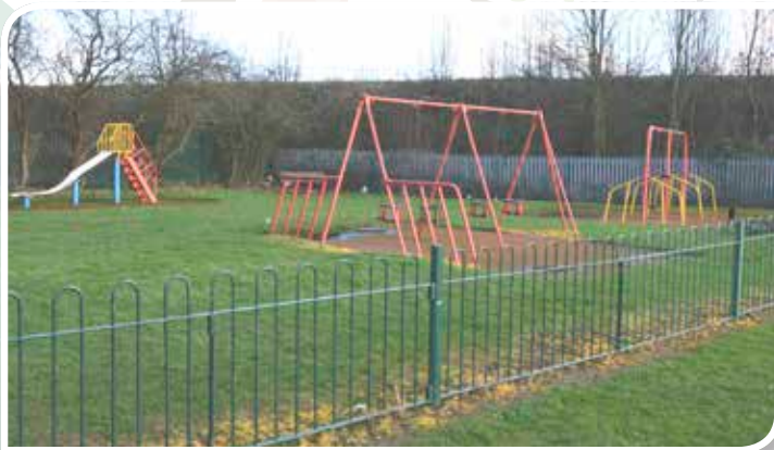
Current Goldsmith Centre playground

"Such developments are expensive and have to be maintained, which is why the senseless, costly anti-social behaviour that has taken place at Anchorage Lane and other play areas must not continue or it threatens to derail our plans. My message is: please look after these community areas - they belong to you and you have helped to pay for them."