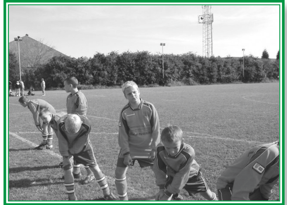
Rangers players warming up.

The Rangers are still on the look out for a dedicated pitch as they currently ground share with Wheatley Hills Rugby Club, a partnership that is much appreciated.