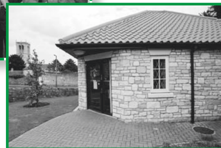
Scott Practice branch Surgery